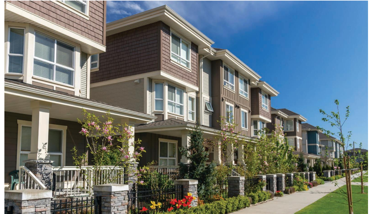
Glacier Ridge in Calgary, Alberta