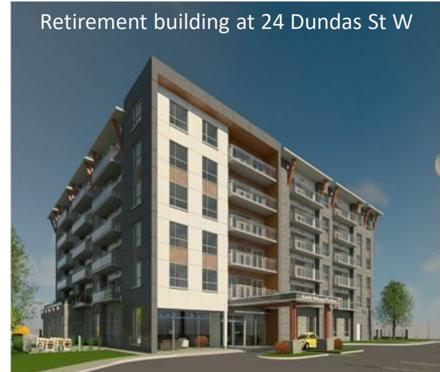
Retirement building at 24 Dundas St W