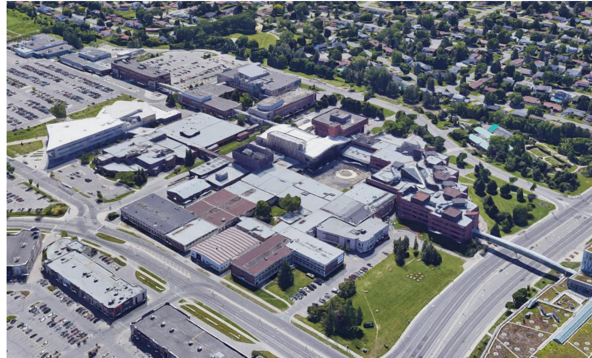
Algonquin College, Ottawa