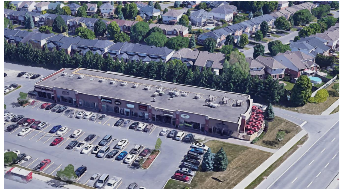
Amenity node in Riverside South, Ottawa