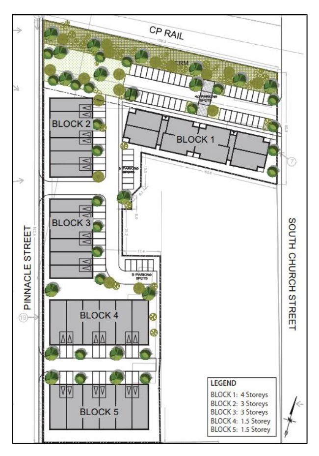
Figure 2: Site Concept Plan for 105 Pinnacle Street (not to scale; image source: Hobin Architecture Incorporated)